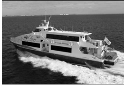
Figure 4: Willingness to pay for ferry Figure 2: The Proposed Vessel: Highspeed service